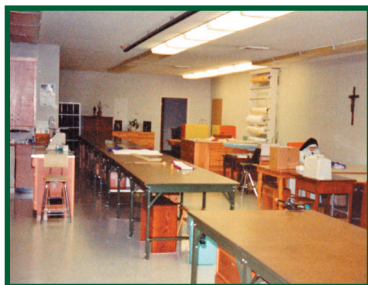
CW in new building

By the time we moved to the new building in 1967 the vestment department was in full swing. The Cloistered Workshop's importance to our monastery was evident in its size... it stretched half the length of our current main building. Numerous sisters worked there, making beautiful vestments, washable miters for bishops, altar linens, washable palls and other items for liturgical use. At that time, we had a large mail order business going, and it helped tremendously with the debt incurred while building our permanent monastery. However, by the late 1970s the peak of production had passed.