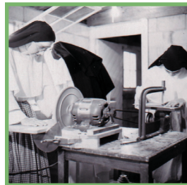
Cutting plexiglass for palls