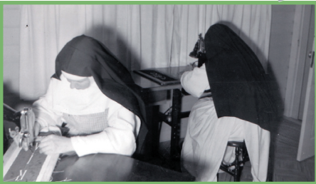
Working at first embroidery machines