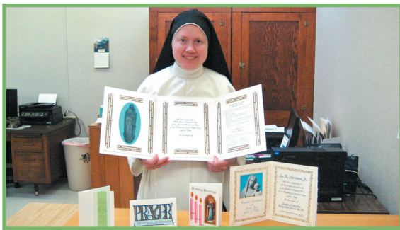
Samples of our enrollments

Perpetual enrollments are suitable for any occasion. A perpetual enrollment is a three-panel embossed folder suitable for display. It comes in two sizes, small (6 ½” by 8 ½”) and large (9” by 11”). The name of the person enrolled and the person requesting the enrollment are inscribed in calligraphy. We remember the people who are enrolled in our daily prayers and Masses. The enrollment itself is placed in the center panel and the benefits of enrollment are placed in the right panel. The left panel may have a religious picture. We have various images, including the Good Shepherd, Madonna and Child, Our Lady of the Rosary, the Monastery Chapel, and the Sacred Heart. Enrollments may be customized; please call or write to ask about this. An enrollment is a beautiful and thoughtful gift for graduations, weddings, anniversaries, memorials, or times when you want to say a special Thank You.