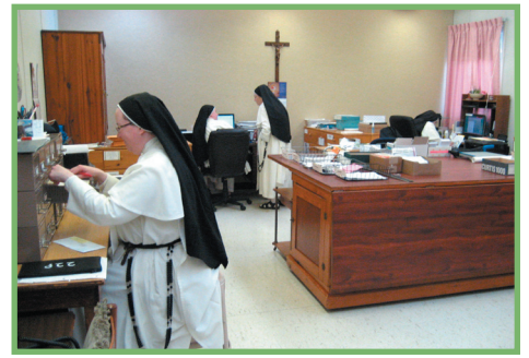
Filing cards in new Guild

The former Cloistered Workshop room has now become the new home of our Infant Jesus Guild department and our mailroom. This is another department that dates back to the early days of our monastery. Those working in the Guild are responsible for providing our beautiful perpetual enrollments, as well as personalized greeting cards; they answer the mail, record donations, and express thanks to our many benefactors; and of course they also mail out the issues of “Monastery Bells” and post them on our website! Now that the Cloistered Workshop is closed we are trying to build up the Guild department, so we would like to tell you (or remind you of) what we have to offer!