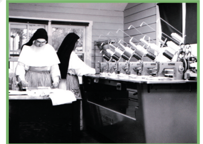
Computerized embroidery machine