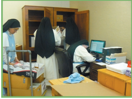
Getting settled in the Guild