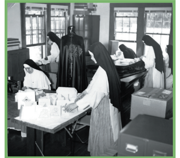
Nuns at work in CW

In the Constitutions of the Nuns of the Order of Preachers, we read: "The nuns procure their livelihood chiefly by diligent work and moderation in their life style and expenditures; and at the same time they accept gratefully the gifts of benefactors." Almost from our first years in Lufkin, a large part of the "diligent work" we did was in the Cloistered Workshop (the vestment department). In the early 1950s, the nuns wanted to expand and improve their sewing abilities and received expert help in using their new embroidery machines and in the study of liturgical design from two Precious Blood Sisters from O'Fallon, Missouri. Later, in the 1960s computerized embroidery machines were purchased which sewed multiple designs using punch cards.