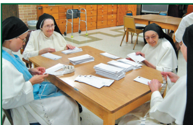
Preparing one of our mailings

We are grateful to all those who have requested our prayer cards in the past, but we realize that it is time we updated. Our goal is to begin to introduce new designs for the cards gradually. We hope that this will make the cards more appealing and useful for you. We are also pleased to announce that we will be adding Mother’s Day and Father’s Day enrollment cards to our selection this Spring.