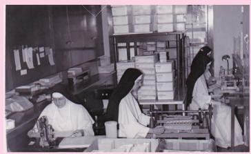
More room in the "new" building

for this purpose. There the sisters prepared the batter and poured it on the baker. The result was a large rectangular sheet of hosts with embossed crosses on top. Then the sheets were carefully dampened to facilitate cutting the hosts into small circles, and to prevent breaking. (Later a humidifier was designed and built by one of the nuns.) Finally, the hosts were packed and shipped to the parishes. It was quite a process! God blessed the work, and within ten years a new building was constructed to house the growing altar bread department.