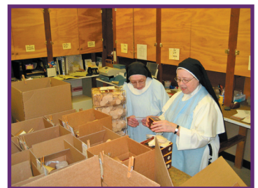
Preparing a shipment

Right now the Altar Bread department serves about 150 churches and religious houses in 5 states. Some of the churches receive altar breads on a monthly basis, while others order them when needed. The sisters in the Altar Bread department strive to help churches by accommodating their various needs through shipping preferences (U.S. Mail, FedEx, etc.) or in adjusting the quantity of altar breads. Some of the churches may not need a full box of altar breads, and the sisters are happy to open a box and repackage the hosts so that the church may receive the exact amount they need. In addition to the traditional Cavanaugh altar breads, we also distribute low-gluten hosts to churches who request them. If you know a parish looking for a way to support religious life and receive quality altar breads with excellent service, please contact us!