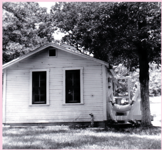
1st Altar Bread Department

"Whatever your task, work heartily, as serving the Lord." (Col. 3:23)