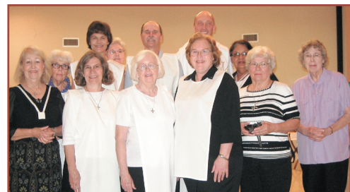
Members of St. Thomas Aquinas Chapter