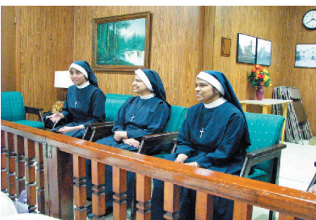
The Sisters of the Destitute